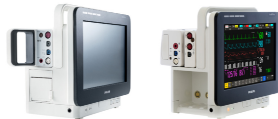
The IntelliVue MX450 (left) uses multi-measurement modules with primary measurements. The IntelliVue MX500 (right) adds the possibility of adding additional measurement modules.

The monitors also have built-in Advanced Clinical Solutions that provide tools to summarize and visualize complex clinical data and their interactions. Multiple streams of information come together in one, intuitive view.